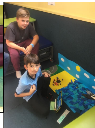
Senior Hub students working on 'Animation'.