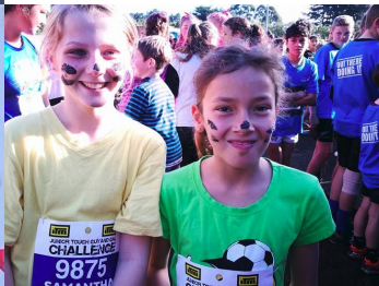
TOUGH GUY / GAL CHALLENGE