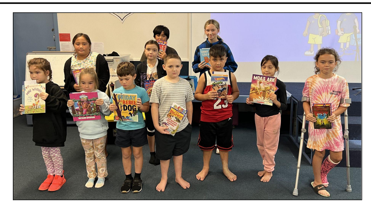
'Students of the Week'