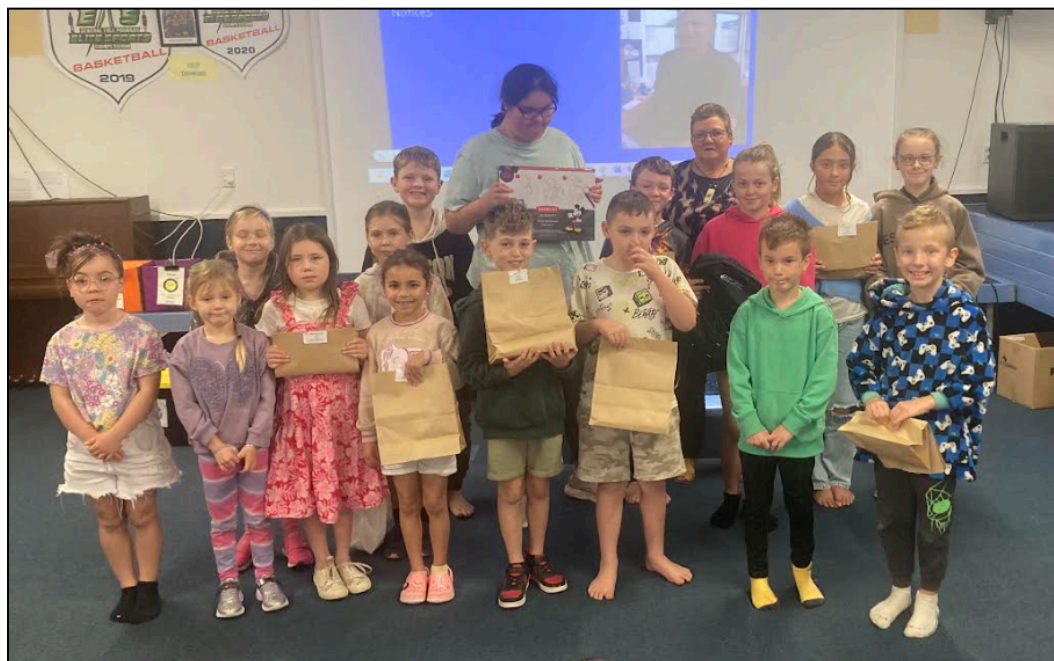
Windmill Trust poster competition winners