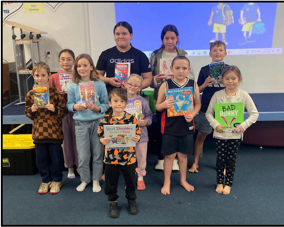
Students of the week