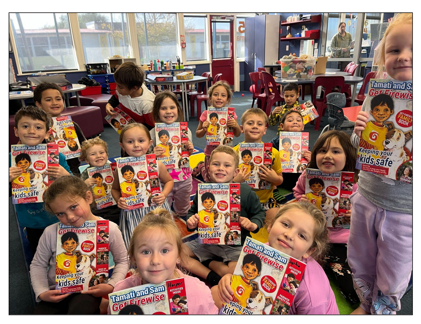
Children in Room 5 with their Firewise booklets from the unit of work we are doing in collaboration with the local fire brigade