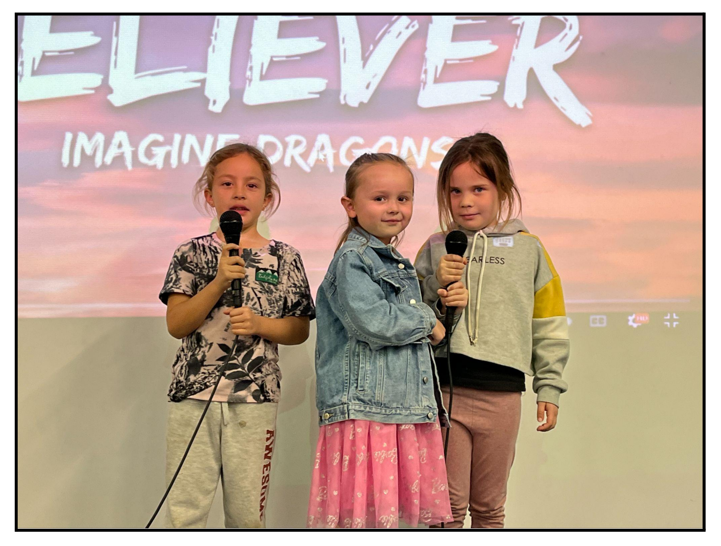
Amazing talent at last weeks School Assembly